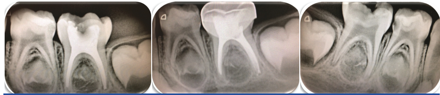
[Table/Fig-4]: Postoperative radiograph showing obturation with metapex in relation to left mandibular primary second molar. [Table/Fig-5]: Postoperative radiograph after six months with no evidence of furcal infection in relation to left mandibular primary second molar. [Table/Fig-6]: Pre-operative radiograph showing radiolucency involving pulp in relation to left mandibular first and second molars. (Images left to right)

procedure was planned. Left inferior alveolar nerve block was administered to anaesthetize both first and second molars using 2% lignocaine with 1:80,000 adrenaline (Lignox, Indoco Remedies Ltd. Mumbai, India). Access opening was done for both the molars followed by removal of coronal tissue. The mesiobuccal, mesiolingual and distal canals were located using appropriate size K-file. A working length was determined using pre-operative radiograph. Biomechanical preparation was performed with Kedo-S Ni-Ti rotary instruments. In second primary molar, D1 rotary file was first used followed by E1 rotary file to prepare the mesiobuccal canal. Only D1 rotary file was used to prepare mesiolingual canal because the canal was narrow compared to mesiobuccal canal. E1 rotary file was used to prepare the distal canal [Table/Fig-7]. In first primary molar D1 rotary file was used to prepare the mesiobuccal and mesiolingual canals. E1 rotary file was used to prepare the distal canal [Table/Fig-8]. The prepared root canals were obturated with Metapex [Table/Fig-9]. The coronal seal was obtained with glass ionomer cement (GC Fuji II, Tokyo, Japan). Finally size five stainless steel crown was selected for second molar followed by size four crowns for first molar (3M ESPE, St, Paul, MN, USA) was cemented using type I glass ionomer cement. At six months follow up both