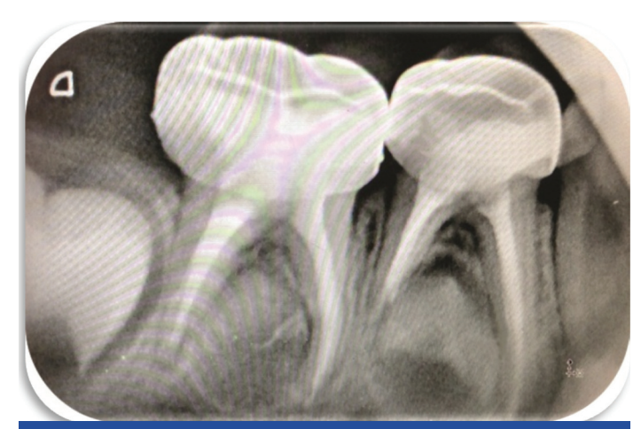
[Table/Fig-10]: Postoperative radiograph after six months with no evidence of furcal infection in to relation left mandibular primary first and second molars.